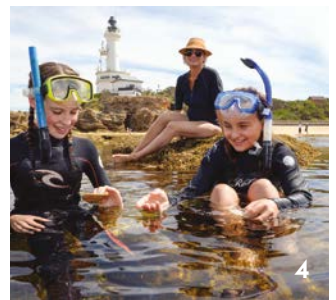
1. Phillip Island Nature Parks Penguins Plus, Phillip Island 2. Puffing Billy Steam Railway, Yarra Valley & Dandenong Ranges 3. Rocky Creek Strawberry Farm, Mornington Peninsula 4. Point Lonsdale Rockpools and Lighthouse, Geelong & The Bellarine